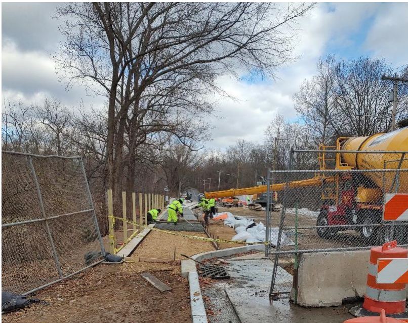
Pine Road looking north toward Bloomfield Avenue.