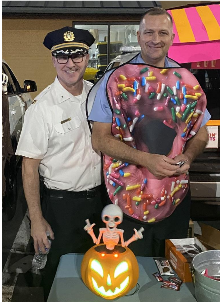
7 th District Halloween Trunk or Treat – October 30, 2024