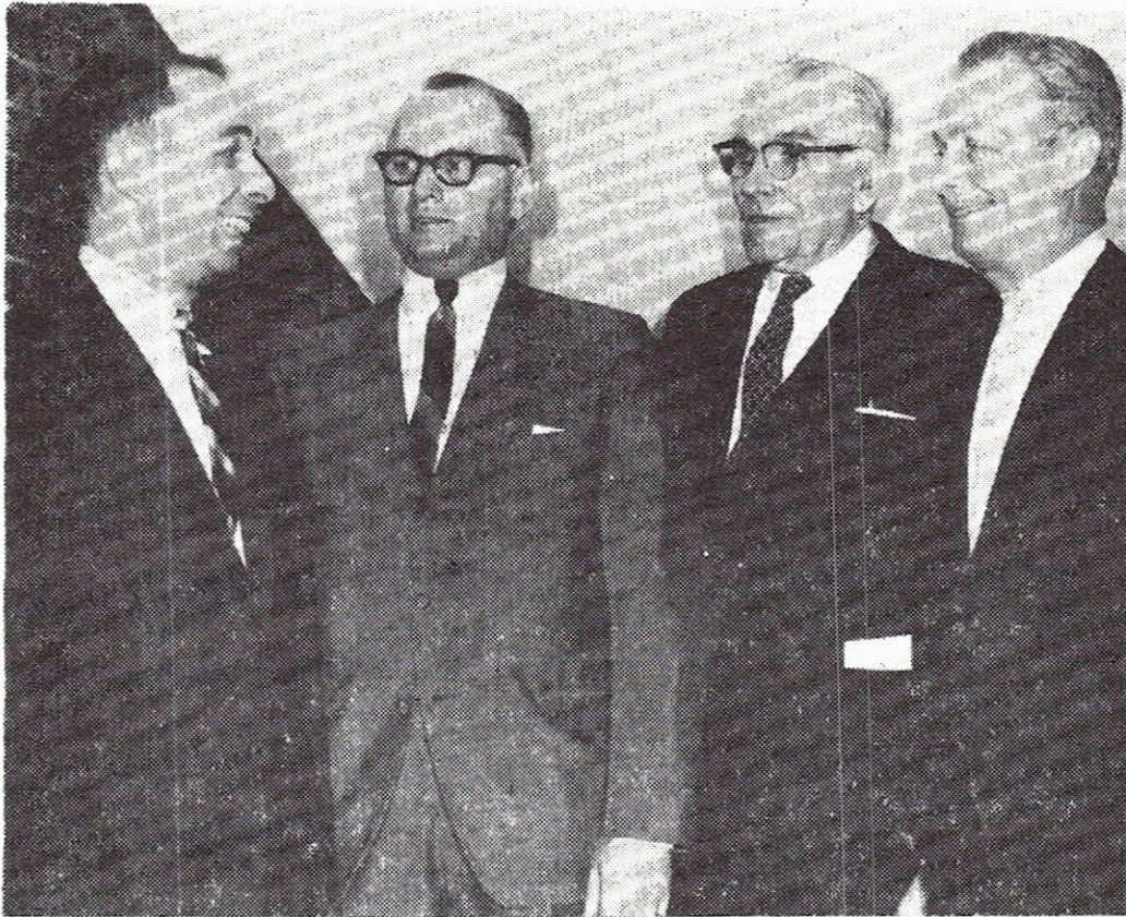
The Bustleton Civic League was privileged last week to hear three leading councilmen discuss recreation, zoning and school facilities.